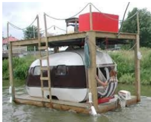
Just kidding, wasn't really there