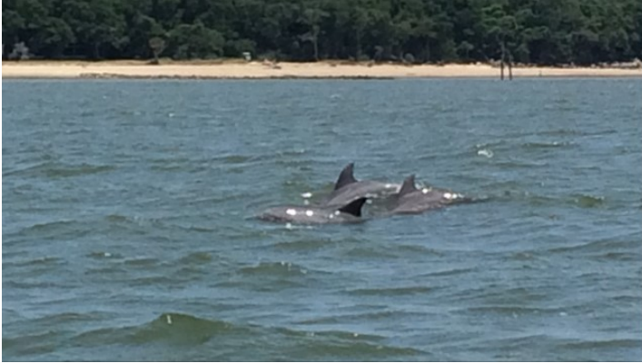
Dolphins photo captured by Carter Stevenson