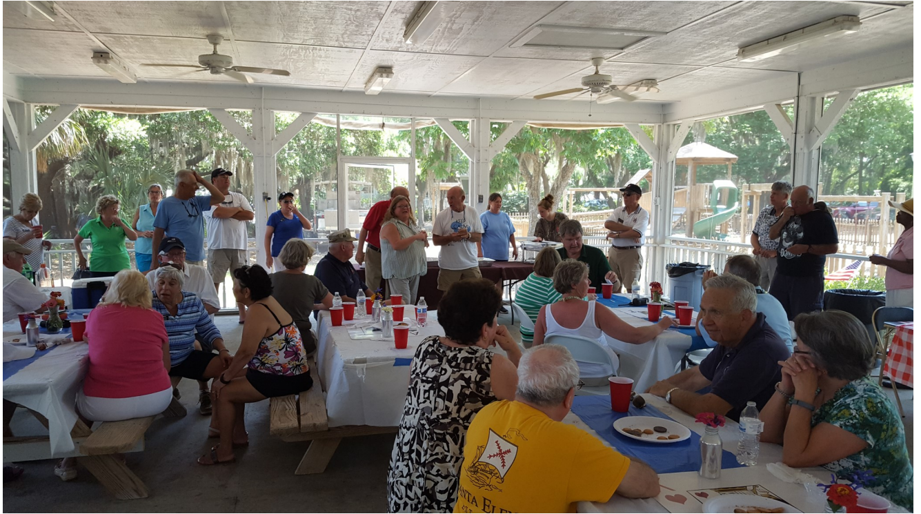
A big crowd at the Dataw Marina Fish Fry