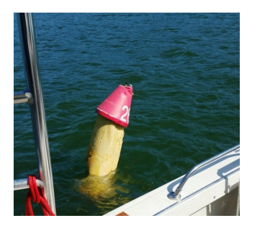
Destroyed, imagine the racket

In addition to damage they are often missing or seriously out of position. The photo shows a fish concentrator ashore near T60.