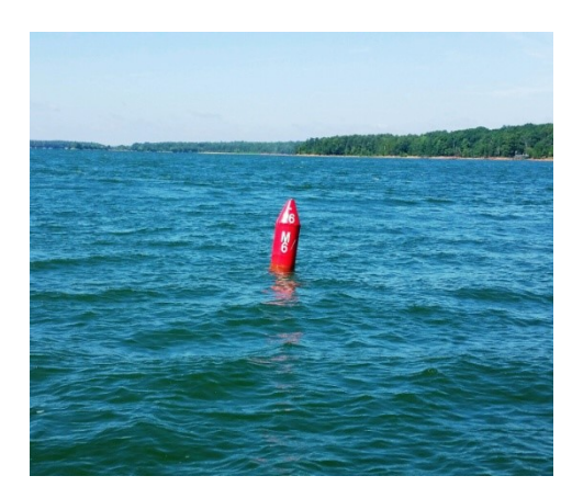
What they should look like