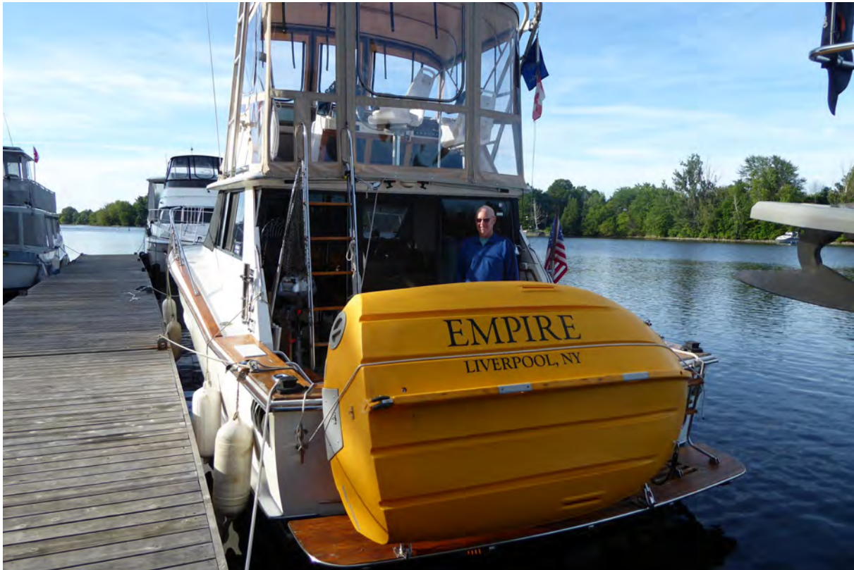
Hanging out at the Long Island lock station, waiting for the ok to go.