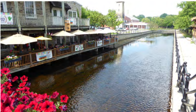
Beautiful town of Perth