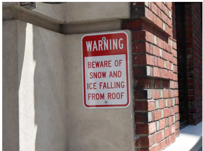
Reason 101 of why we love the South