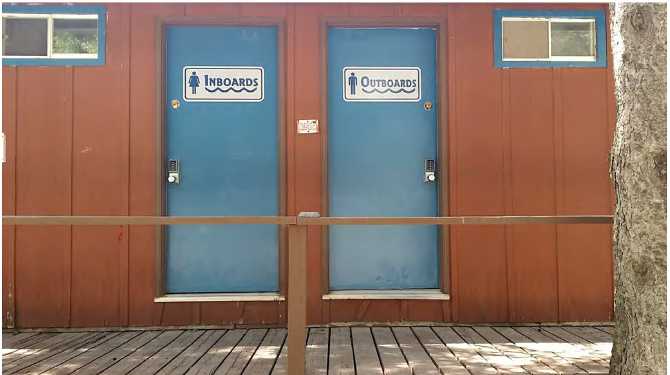
A little Canadian humor at Lens' Cove Marina in Portland, Ontario