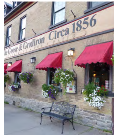
Restaurant in Merrickville, Jewel of the Rideau