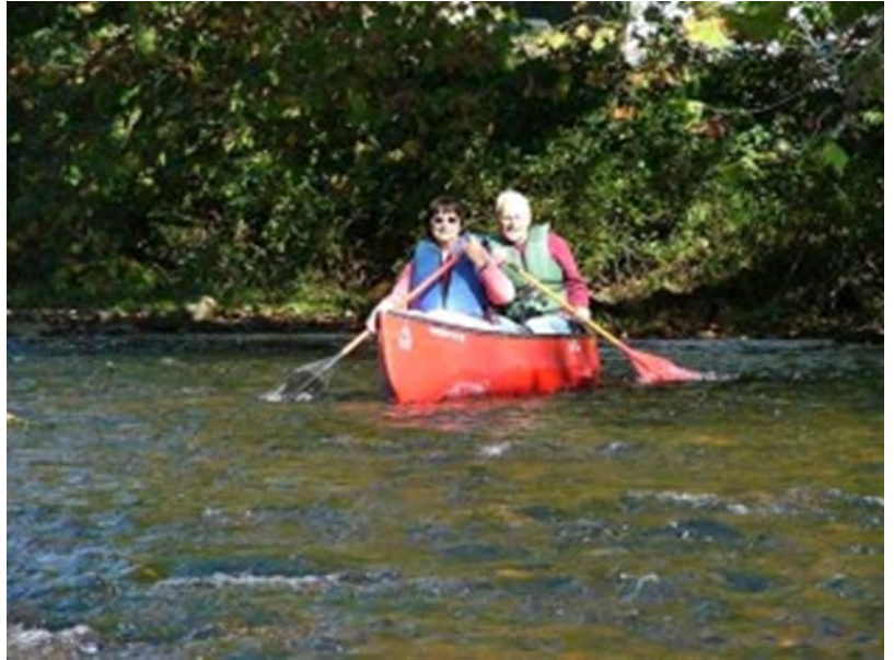
Looks like about our speed,, right?

If you supply your own boat, $25 per boat.